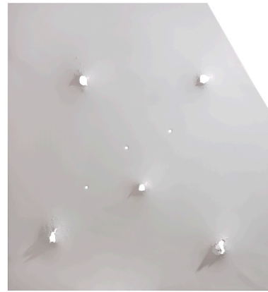
Sunday Morning II, 2015 50 x 46 in / 127 x 116 cm stainless steel, gunshot and powder coating